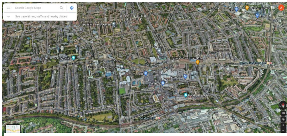
A highly densely populated area with very little open green space / park provision - very unlikely to be meeting the council's green space standards for park provision