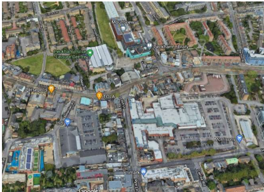
Morrisons and Lidl sites directly south of the park likely to be developed for mixed-use residential / commercial in future, increasing the local population further